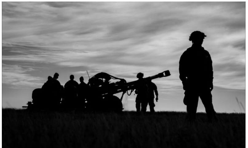
Soldiers from Bravo Battery, 3-320th AFAR, 3rd BCT, 101st Airborne Division conduct sling-load operations and elevator drills on Mihail Kogalniceanu Air Base, Romania.

Task Force 82, from the 82d Airborne Division, leads critical aspects of the US military to assure Allies and partners, deter adversaries, and reinforces NATO security force assistance in the Black Sea region.